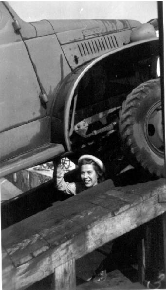
At the engine cleaning ramp. Engineer Replacement Training Center Motor Pool Fort Leonard Wood, Missouri October 1943

Her training included hiking ten miles while wearing a backpack and an obstacle course, where she crawled on her belly under barbed wire.